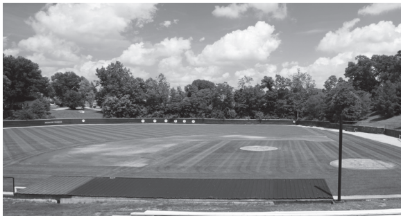
Walker Field at DePauw University