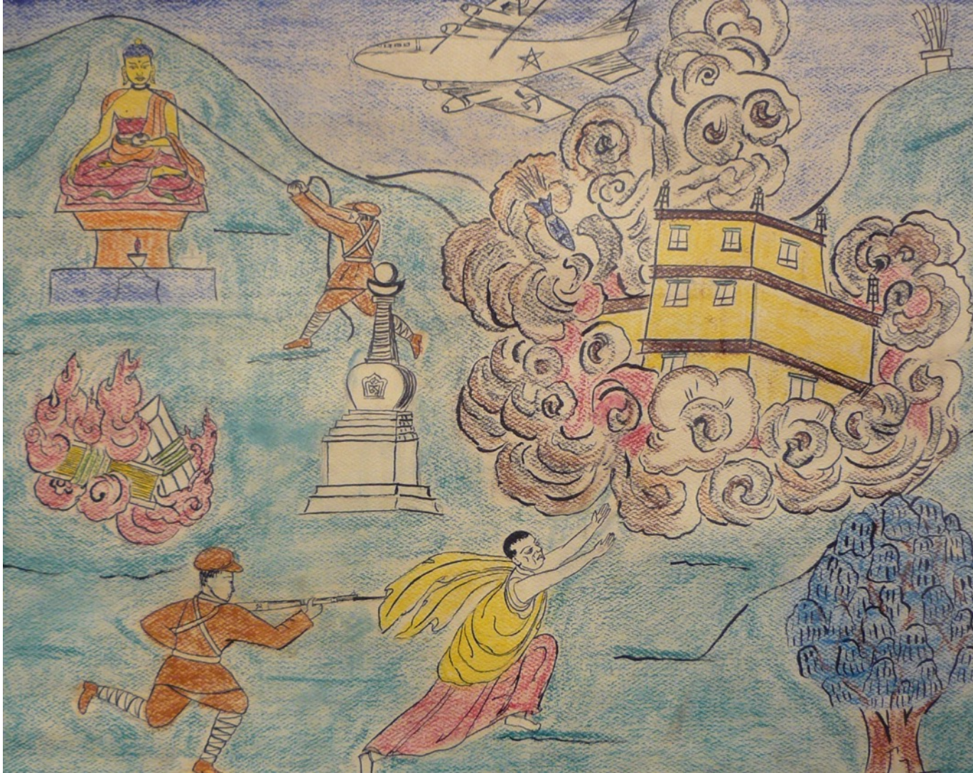
Drawing Depicting the Devastation of Tibetan Monasteries / 1962