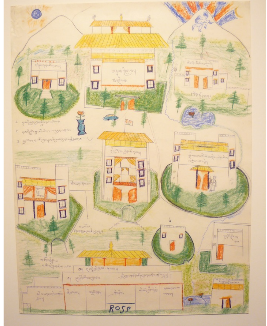
Lotus Field Drawing / 1962