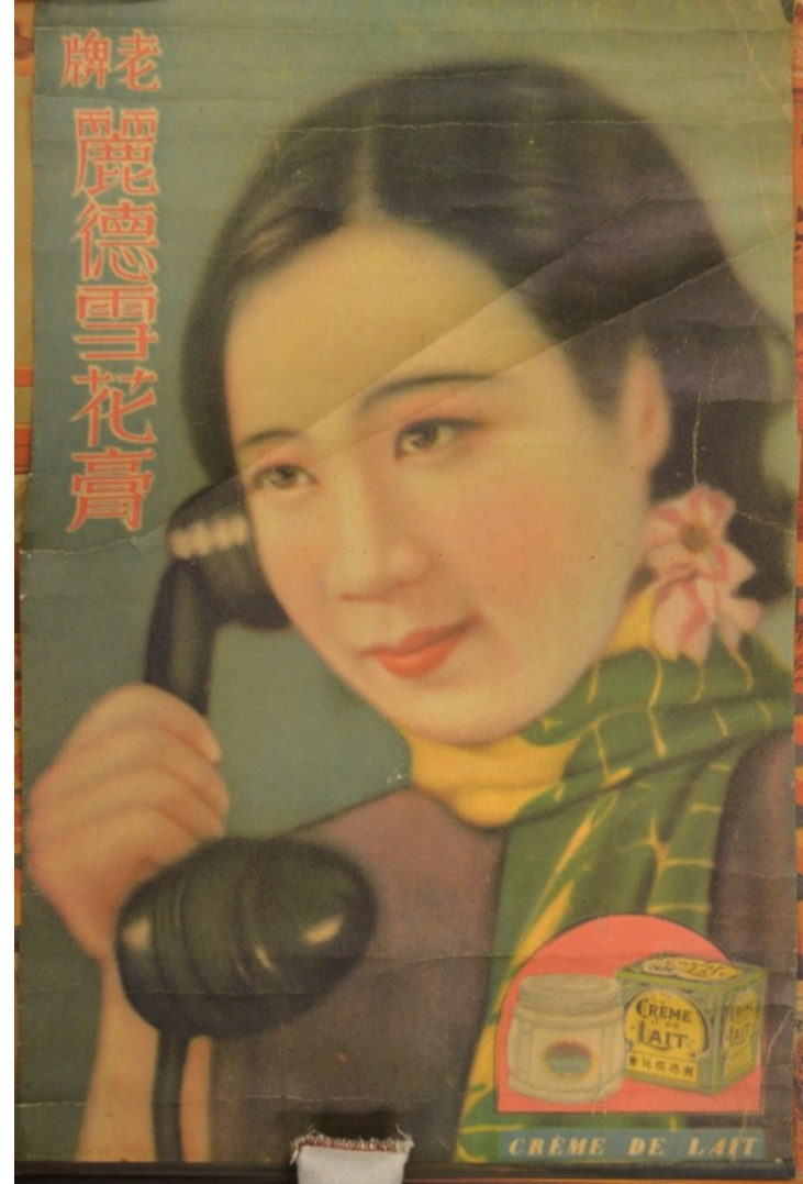
Shanghai Calendar Advertisements / 1920s Lithograph on paper DePauw University Purchase