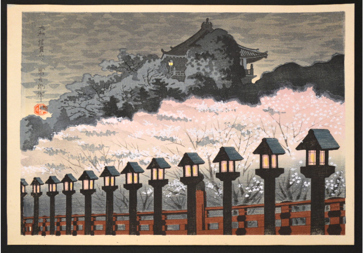
The Cherry Blossoms of Mt. Shigi / early-mid 20 th c. From the Series: Scenes of Sacred Places and Historic Landmarks in Japan