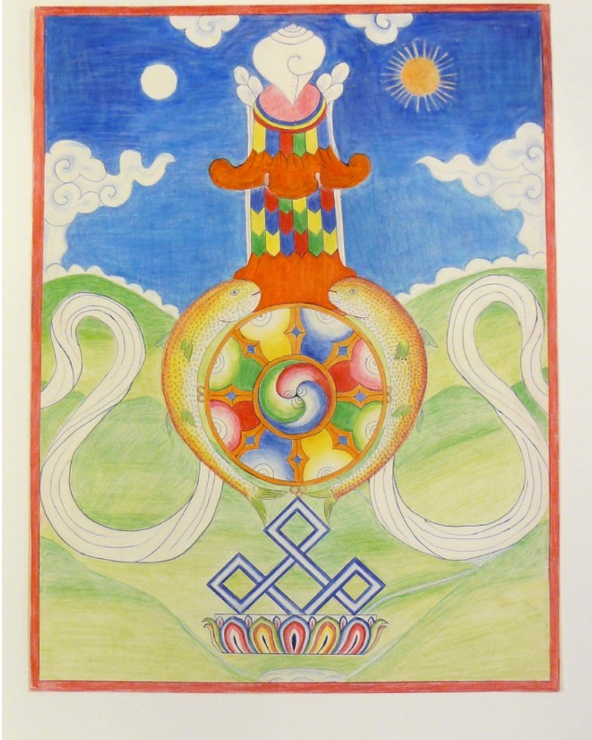
Drawing of the Eight Sacred Emblems of Buddhism / 1962