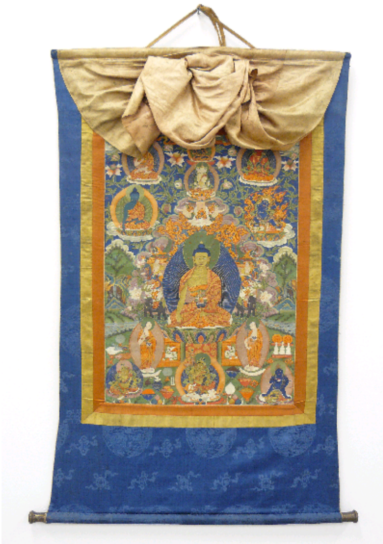
Shakyamuni Buddha / 19 th c. Thangka; paint on silk 2002.4.5 Gift of Bruce Walker '53