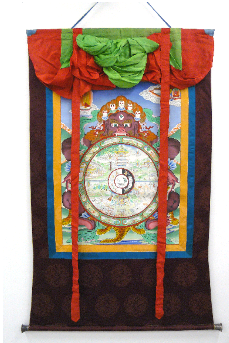
Yama, the Lord of Death / 19 th c. Thangka; paint on silk 2002.4.7 Gift of Bruce Walker '53