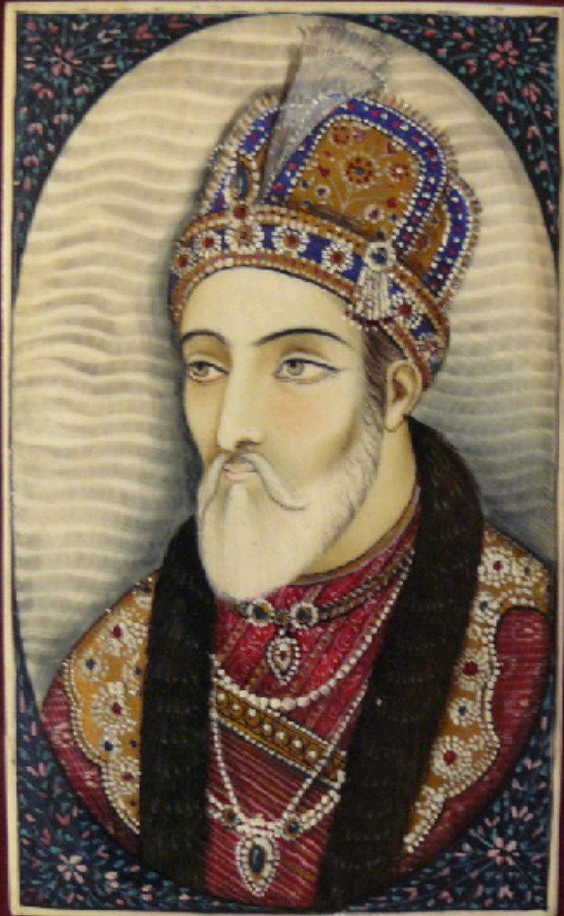
Miniature portrait of Mughal ruler Bahadur Shah Zafar / mid-19 th c.

Paint on ivory with semi-precious stones