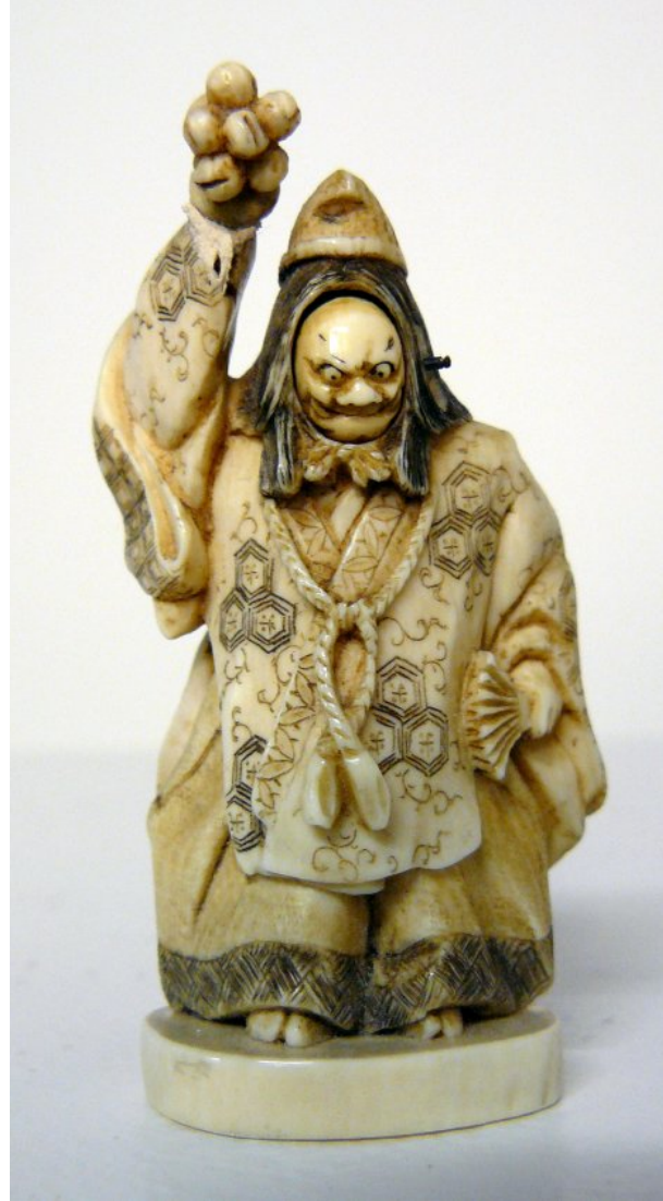
Figure with spinning face / mid-18 th c.