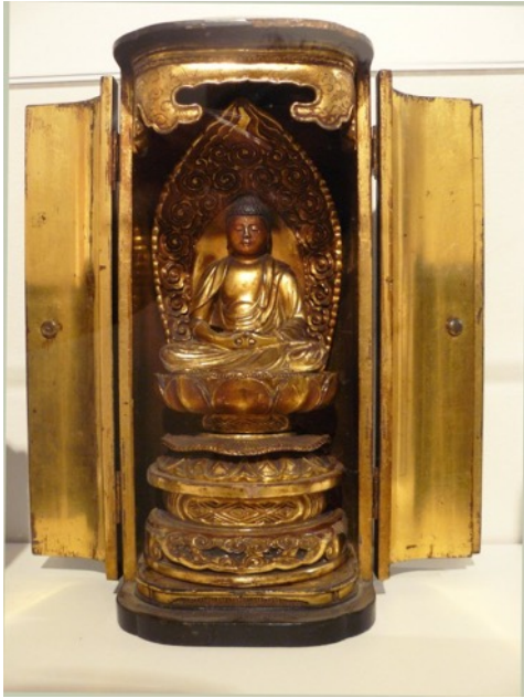
Butsudan/ 16 th c. Lacquered wood 1885.1.1 Gift of OGATA Sennosuke, class of 1905