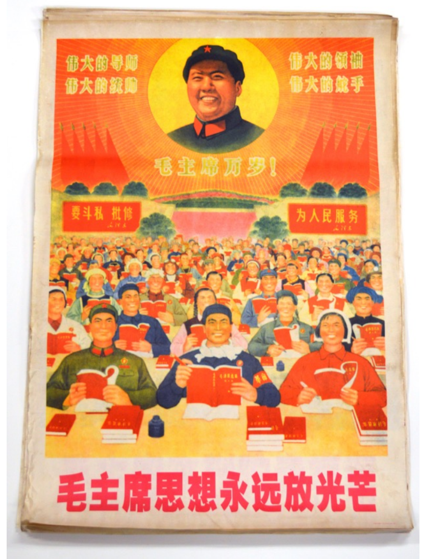
Chinese Cultural Revolution Posters / 1960-1970