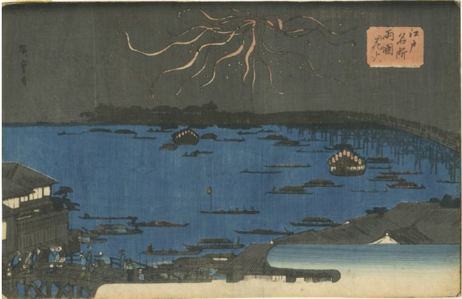
Ryogoku Bridge , from the series Noted Views of Edo / 1860s