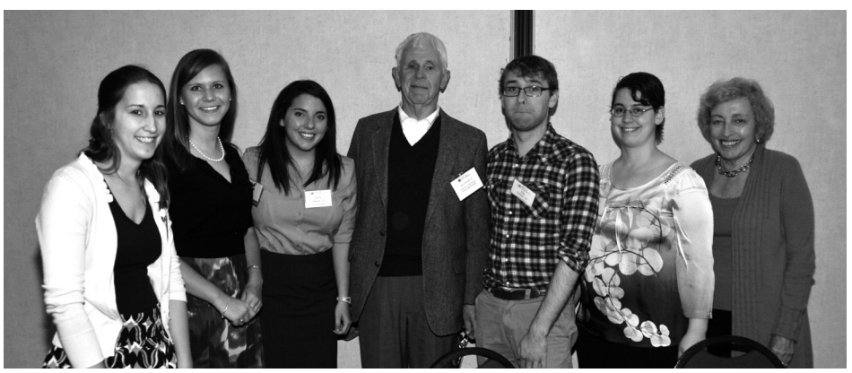
Rector seniors attending The Washington C. DePauw brunch during Old Gold Weekend.