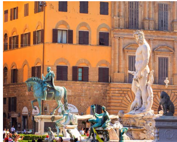
Image at top right: The medieval Palazzo Vecchio, the seat of Florence's republican council. Top image at left: The Mercato Nuovo, one of Florence's outdoor markets. Bottom image at left: The Fountain of Neptune in the Piazza della Signoria with some of Florence's many outdoor sculptures.