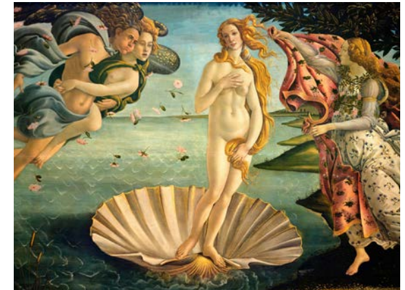
Top image: The Ponte Vecchio, standing since 1345, is the oldest bridge in Florence. Bottom left: The Via dei Calzaiuoli, one of Florence's many pedestrian shopping streets. Bottom right: Sandro Botticelli's iconic Birth of Venus in the Uffizi Gallery.