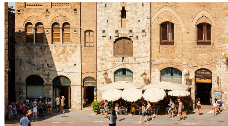
Cafés and medieval palaces, San Gimignano.