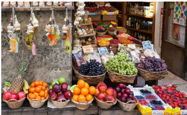
Market in Siena.

Please note that final payment is due by May 1, 2017.