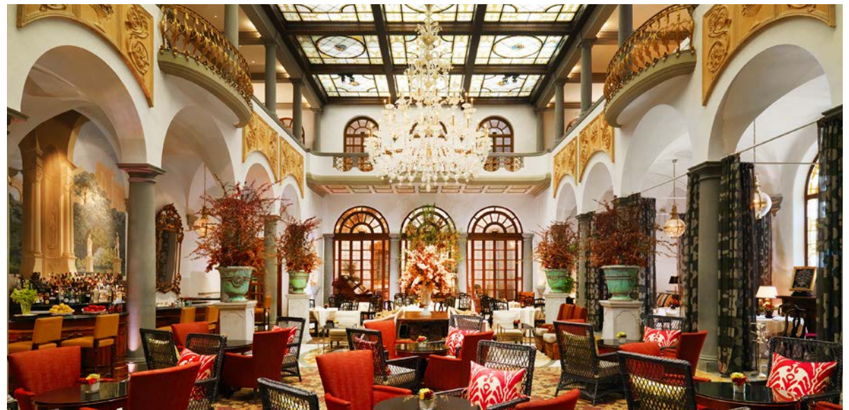
The elegant Michelin-starred restaurant of the Hotel St. Regis, located in the courtyard of a 16th century palace designed by the Renaissance architect Brunelleschi.