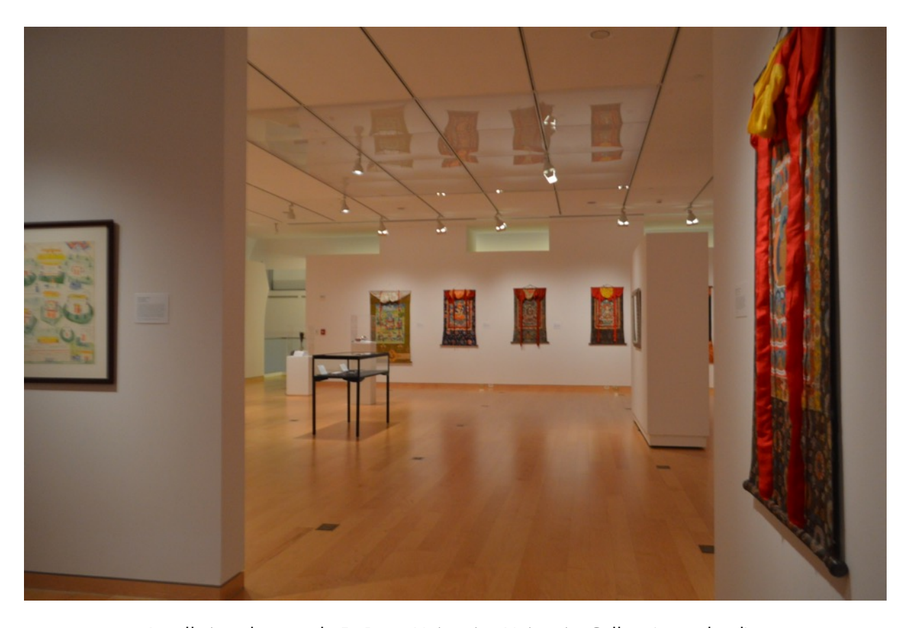
Installation photograph: DePauw University, University Gallery (upper level).