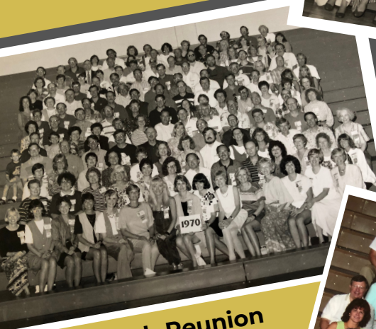
25th Reunion June 1995