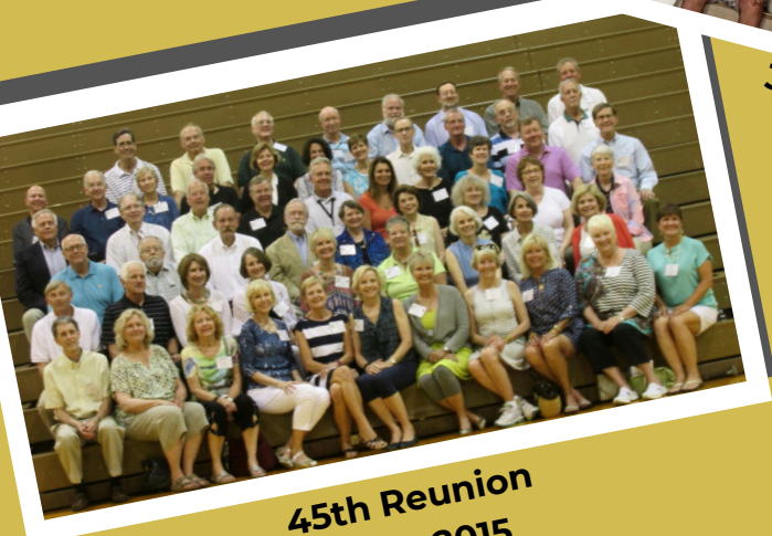
45th Reunion June 2015