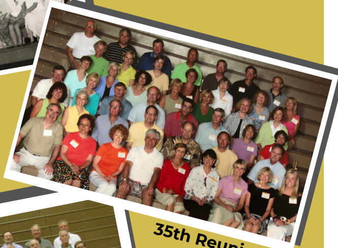
35th Reunion June 2005