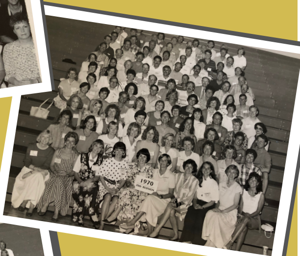
20th Reunion June 1990