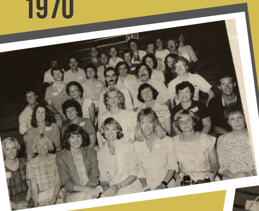
15th Reunion June 1985