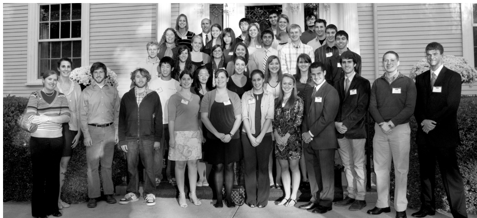
2010-11 Rector Scholars at The Elms.

If I can provide any information or assistance regarding the Rector Scholarship Program, please e-mail me at johnmorrill@depauw.edu or write to me at Bartlett Alumni House Annex, DePauw University, P.O. Box 37, Greencastle, IN 46135-0037. Please send any suggestions for future issues of Rector Record .