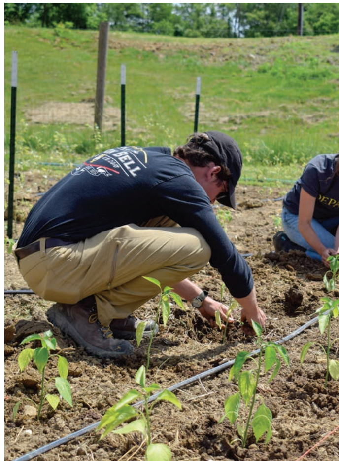
Above: Students plant crops at the Ullem Campus Farm.