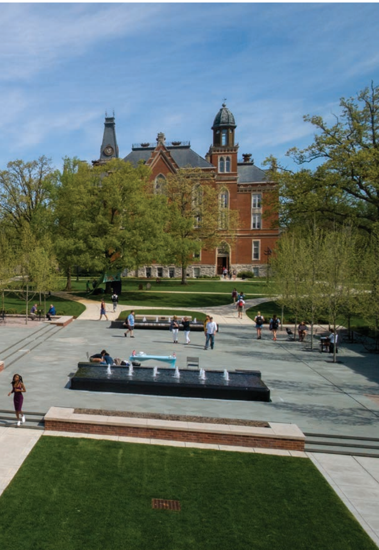
Above: R. David and Suzanne A. Hoover Hall and James G. Stewart Plaza, funded through the campaign.