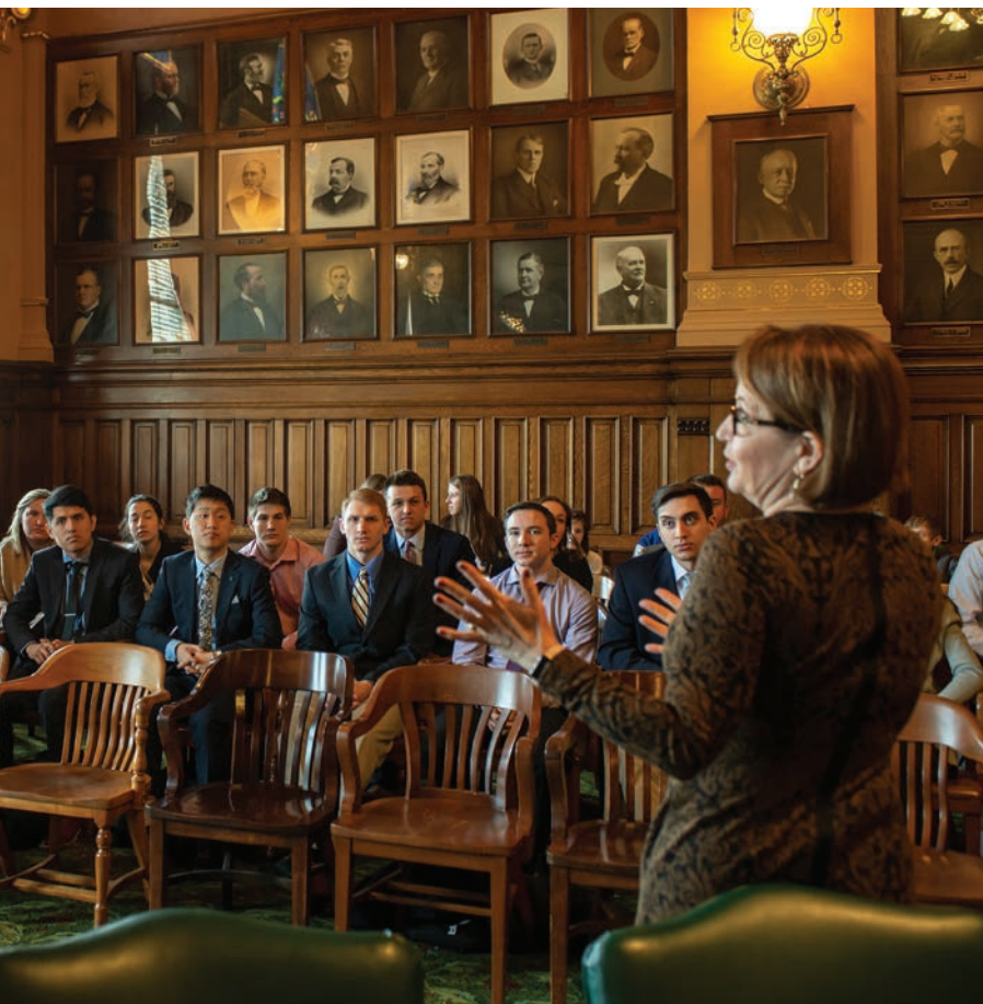
Above: Winter term students interested in law careers visit the Indiana Supreme Court.

“Getting theoretical knowledge from DePauw is great, but we need to combine it with real-world experience. DePauw always supports you in pursuing those experiences.”