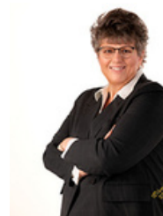
Lynda Dunbar City of Greencastle Mayor