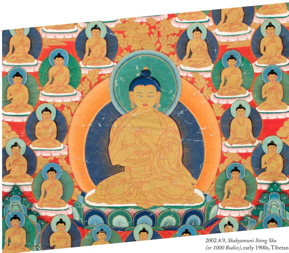
2002.4.9, Skakyamuni Stong Sku (or 1000 Bodies), early 1900s, Tibetan